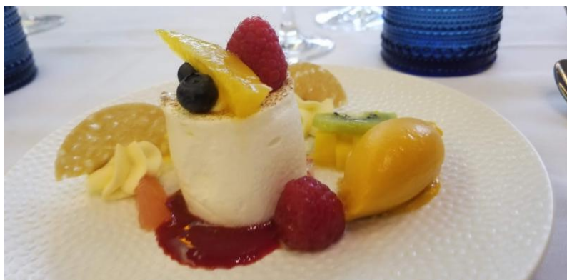
Dessert of Perce Neige, Lemon Chantilly